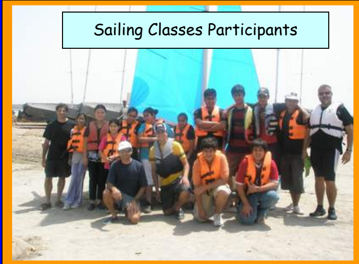
Sailing Classes Participants